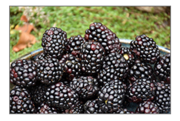
Triple Crown Blackberry fruit

Triple Crown Blackberry features showy clusters of white star-shaped flowers along the branches in mid spring. It has green deciduous foliage. The fuzzy oval compound leaves do not develop any appreciable fall color. It features an abundance of magnificent black berries in mid summer.