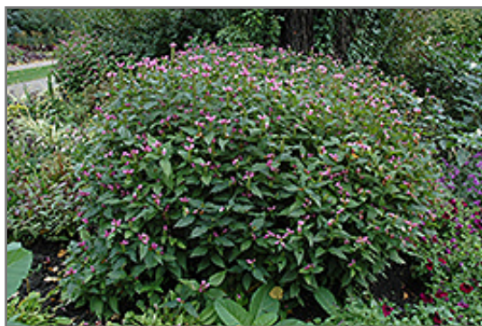
Pink Turtlehead in bloom