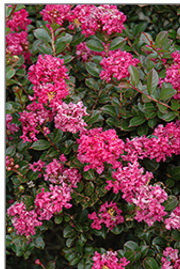
Pocomoke Crapemyrtle flowers

Pocomoke Crapemyrtle is recommended for the following landscape applications;