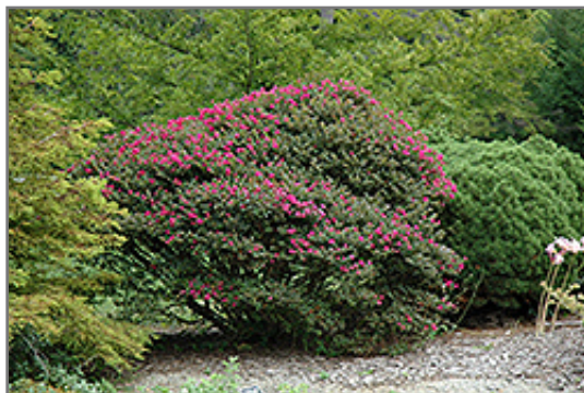
Pocomoke Crapemyrtle in bloom