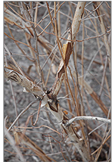
Diablo Ninebark bark

This shrub does best in full sun to partial shade. It is very adaptable to both dry and moist locations, and should do just fine under average home landscape conditions. It is not particular as to soil type or pH. It is highly tolerant of urban pollution and will even thrive in inner city environments. This is a selection of a native North American species.