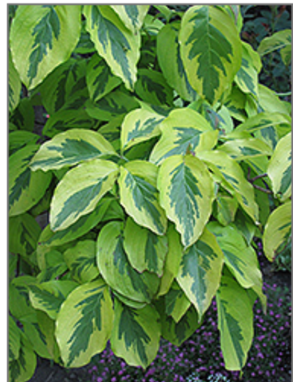
Cherokee Sunset Flowering Dogwood foliage

Cherokee Sunset Flowering Dogwood is recommended for the following landscape applications;