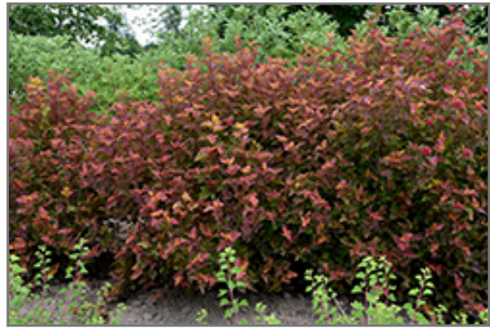
Amber Jubilee Ninebark

This shrub does best in full sun to partial shade. It is very adaptable to both dry and moist locations, and should do just fine under average home landscape conditions. It is not particular as to soil type or pH. It is highly tolerant of urban pollution and will even thrive in inner city environments. This is a selection of a native North American species.