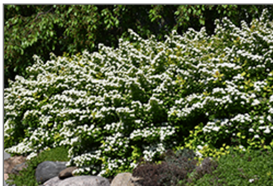
Glow Girl Birch Leaf Spirea in bloom

Glow Girl Birch Leaf Spirea is recommended for the following landscape applications;