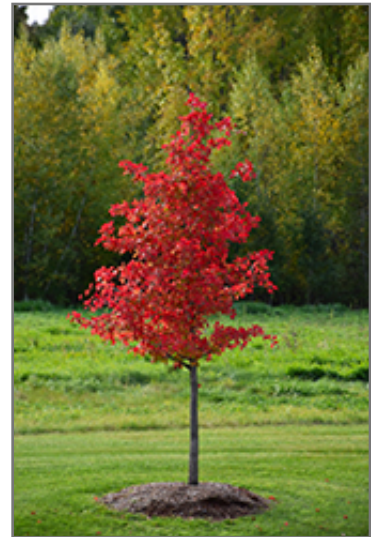
Wildfire Black Gum in fall