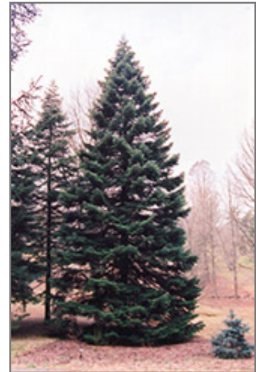
Nordmann Fir

Nordmann Fir will grow to be about 50 feet tall at maturity, with a spread of 25 feet. It has a low canopy, and should not be planted underneath power lines. It grows at a slow rate, and under ideal conditions can be expected to live for 90 years or more.