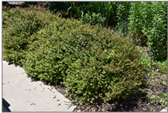
Rose Creek Abelia

Rose Creek Abelia makes a fine choice for the outdoor landscape, but it is also well-suited for use in outdoor pots and containers. Because of its height, it is often used as a 'thriller' in the 'spiller-thriller-filler' container combination; plant it near the center of the pot, surrounded by smaller plants and those that spill over the edges. It is even sizeable enough that it can be grown alone in a suitable container. Note that when grown in a container, it may not perform exactly as indicated on the tag - this is to be expected. Also note that when growing plants in outdoor containers and baskets, they may require more frequent waterings than they would in the yard or garden.