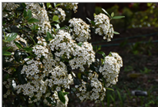
Conoy Viburnum flowers