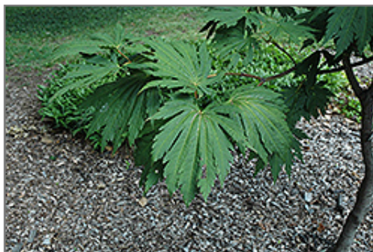
Yama Kagi Fullmoon Maple foliage