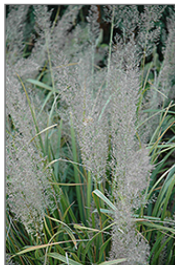
Korean Reed Grass fruit