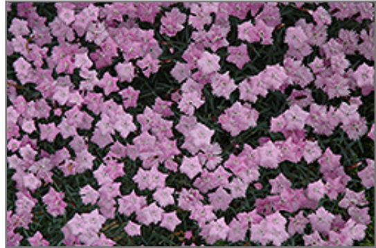
Bath's Pink Pinks in bloom

Bath's Pink Pinks is recommended for the following landscape applications;