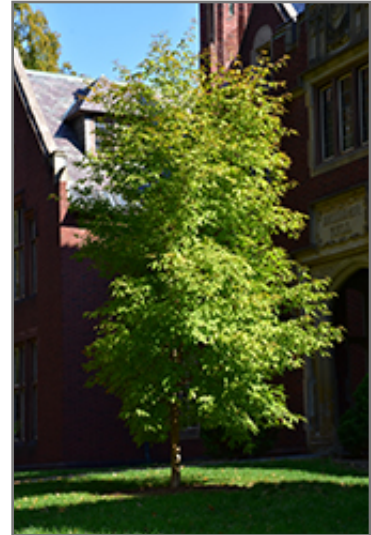
Three Flowered Maple