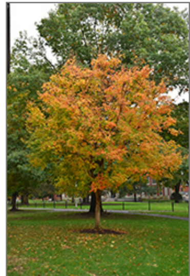
Three Flowered Maple in fall