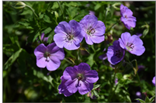
Azure Rush Cranesbill flowers