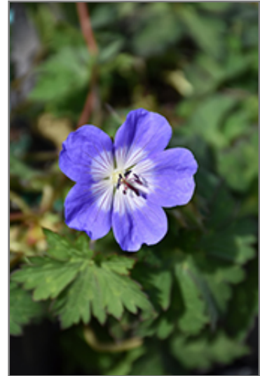
Azure Rush Cranesbill flowers

Azure Rush Cranesbill is recommended for the following landscape applications;