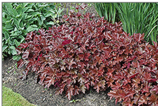
Chocolate Ruffles Coral Bells

This is a relatively low maintenance plant, and should be cut back in late fall in preparation for winter. It is a good choice for attracting hummingbirds to your yard. It has no significant negative characteristics.