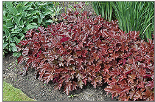
Chocolate Ruffles Coral Bells

This is a relatively low maintenance plant, and should be cut back in late fall in preparation for winter. It is a good choice for attracting hummingbirds to your yard. It has no significant negative characteristics.