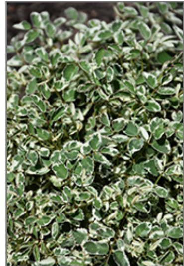
Little Angel Burnet flowers

This plant does best in full sun to partial shade. It prefers to grow in average to moist conditions, and shouldn't be allowed to dry out. It is not particular as to soil type or pH. It is somewhat tolerant of urban pollution. This is a selected variety of a species not originally from North America. It can be propagated by division; however, as a cultivated variety, be aware that it may be subject to certain restrictions or prohibitions on propagation.