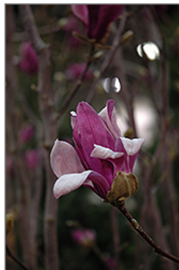
Ricki Magnolia flowers