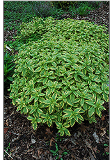
Golden Alexander Loosestrife