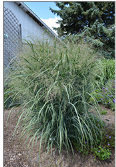
Northwind Switch Grass in bloom

This plant does best in full sun to partial shade. It is very adaptable to both dry and moist locations, and should do just fine under typical garden conditions. It is considered to be drought-tolerant, and thus makes an ideal choice for a low-water garden or xeriscape application. It is not particular as to soil type, but has a definite preference for alkaline soils, and is able to handle environmental salt. It is somewhat tolerant of urban pollution. This is a selection of a native North American species. It can be propagated by division; however, as a cultivated variety, be aware that it may be subject to certain restrictions or prohibitions on propagation.