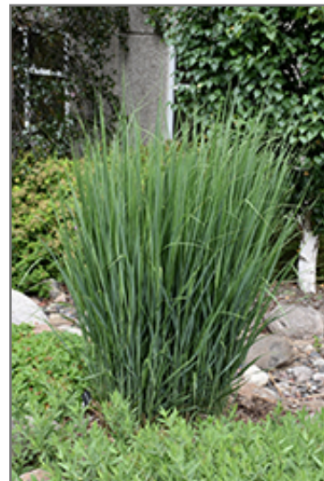
Northwind Switch Grass