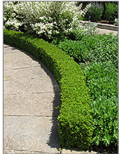
Green Velvet Boxwood

Green Velvet Boxwood makes a fine choice for the outdoor landscape, but it is also well-suited for use in outdoor pots and containers. Because of its height, it is often used as a 'thriller' in the 'spiller-thriller-filler' container combination; plant it near the center of the pot, surrounded by smaller plants and those that spill over the edges. It is even sizeable enough that it can be grown alone in a suitable container. Note that when grown in a container, it may not perform exactly as indicated on the tag - this is to be expected. Also note that when growing plants in outdoor containers and baskets, they may require more frequent waterings than they would in the yard or garden.