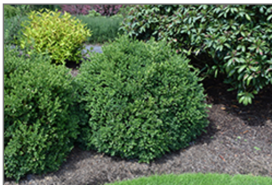
Green Velvet Boxwood