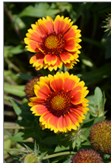
Arizona Sun Blanket Flower flowers

Arizona Sun Blanket Flower is recommended for the following landscape applications;