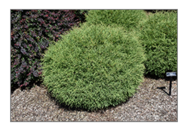
Mr. Bowling Ball Arborvitae