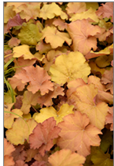
Caramel Coral Bells foliage

Caramel Coral Bells is recommended for the following landscape applications;