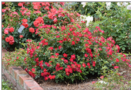
Red Drift Rose in bloom