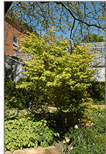
Coral Bark Japanese Maple