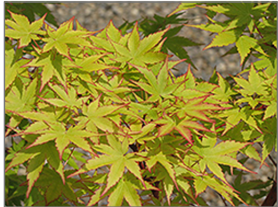
Coral Bark Japanese Maple foliage

Coral Bark Japanese Maple is recommended for the following landscape applications;