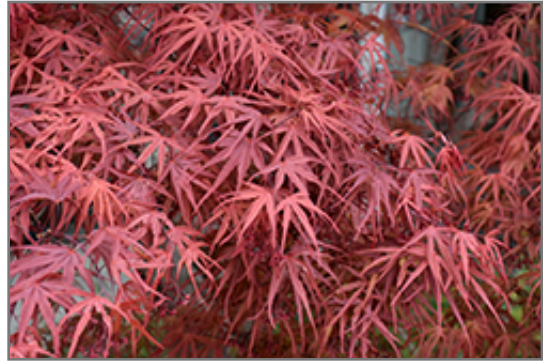
Beni Otake Japanese Maple foliage