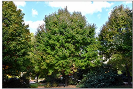
Autumn Flame Red Maple

This tree should only be grown in full sunlight. It is quite adaptable, preferring to grow in average to wet conditions, and will even tolerate some standing water. It is not particular as to soil type, but has a definite preference for acidic soils, and is subject to chlorosis (yellowing) of the foliage in alkaline soils. It is somewhat tolerant of urban pollution. This is a selection of a native North American species.