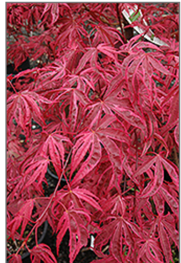
Shirazz Japanese Maple foliage