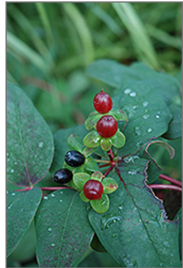
Albury Purple St. John's Wort fruit

Albury Purple St. John's Wort makes a fine choice for the outdoor landscape, but it is also well-suited for use in outdoor pots and containers. With its upright habit of growth, it is best suited for use as a 'thriller' in the 'spiller-thriller-filler' container combination; plant it near the center of the pot, surrounded by smaller plants and those that spill over the edges. It is even sizeable enough that it can be grown alone in a suitable container. Note that when grown in a container, it may not perform exactly as indicated on the tag - this is to be expected. Also note that when growing plants in outdoor containers and baskets, they may require more frequent waterings than they would in the yard or garden.