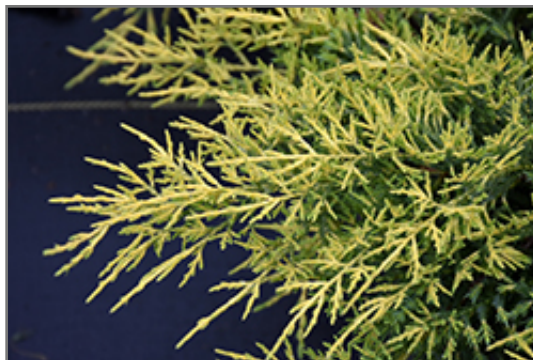
Saybrook Gold Juniper foliage