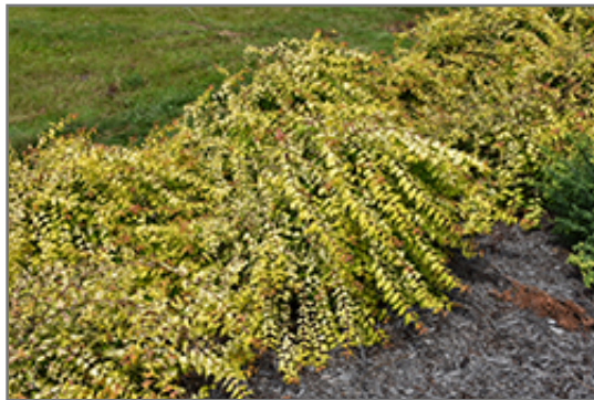
Dream Catcher Beautybush