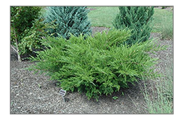
Sea Green Juniper