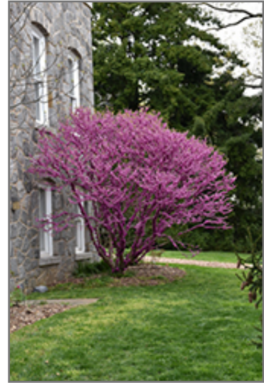
Don Egolf Miniature Redbud in bloom

Don Egolf Miniature Redbud is recommended for the following landscape applications;