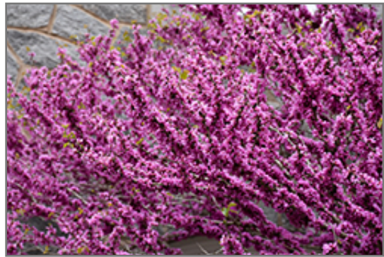
Don Egolf Miniature Redbud flowers