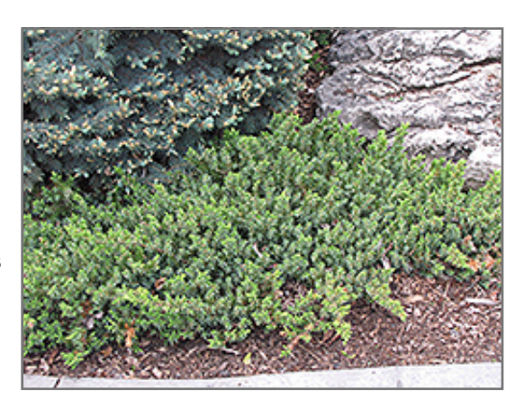
Dwarf Japanese Garden Juniper

This is a relatively low maintenance shrub, and is best pruned in late winter once the threat of extreme cold has passed. Deer don't particularly care for this plant and will usually leave it alone in favor of tastier treats. It has no significant negative characteristics.