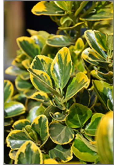
Gold Variegated Japanese Euonymus foliage