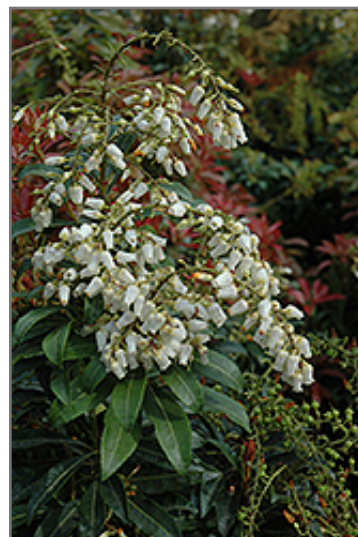
Mountain Fire Japanese Pieris flowers