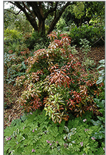
Mountain Fire Japanese Pieris

This shrub does best in full sun to partial shade. It requires an evenly moist well-drained soil for optimal growth, but will die in standing water. It is very fussy about its soil conditions and must have rich, acidic soils to ensure success, and is subject to chlorosis (yellowing) of the foliage in alkaline soils. It is somewhat tolerant of urban pollution, and will benefit from being planted in a relatively sheltered location. Consider applying a thick mulch around the root zone in winter to protect it in exposed locations or colder microclimates. This is a selected variety of a species not originally from North America, and parts of it are known to be toxic to humans and animals, so care should be exercised in planting it around children and pets.