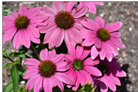
PowWow Wild Berry Coneflower flowers