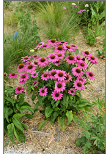
PowWow Wild Berry Coneflower in bloom

This is a relatively low maintenance plant, and is best cleaned up in early spring before it resumes active growth for the season. It is a good choice for attracting birds and butterflies to your yard, but is not particularly attractive to deer who tend to leave it alone in favor of tastier treats. It has no significant negative characteristics.