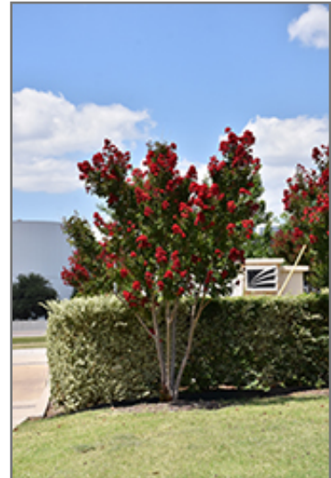
Dynamite Crapemyrtle in bloom