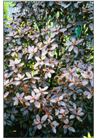
P.J.M. Elite Rhododendron in fall

This shrub does best in full sun to partial shade. You may want to keep it away from hot, dry locations that receive direct afternoon sun or which get reflected sunlight, such as against the south side of a white wall. It requires an evenly moist well-drained soil for optimal growth, but will die in standing water. It is very fussy about its soil conditions and must have rich, acidic soils to ensure success, and is subject to chlorosis (yellowing) of the foliage in alkaline soils. It is somewhat tolerant of urban pollution, and will benefit from being planted in a relatively sheltered location. Consider applying a thick mulch around the root zone in winter to protect it in exposed locations or colder microclimates. This particular variety is an interspecific hybrid.