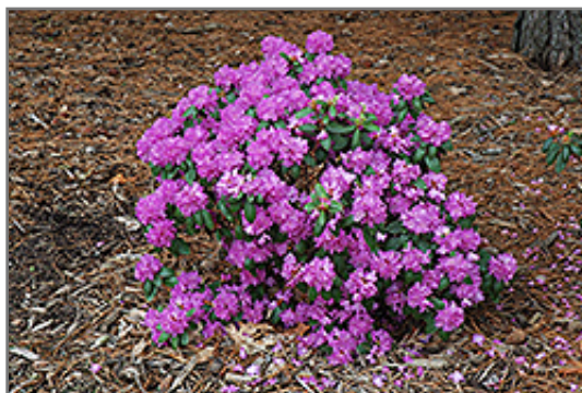
Compact P.J.M. Rhododendron in bloom