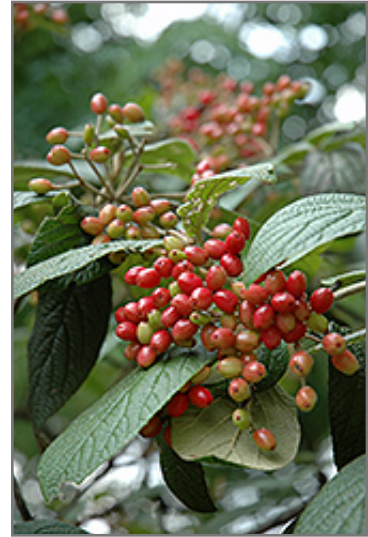
Alleghany Viburnum fruit

This shrub does best in full sun to partial shade. It prefers to grow in average to moist conditions, and shouldn't be allowed to dry out. It is not particular as to soil type or pH. It is highly tolerant of urban pollution and will even thrive in inner city environments. This particular variety is an interspecific hybrid.