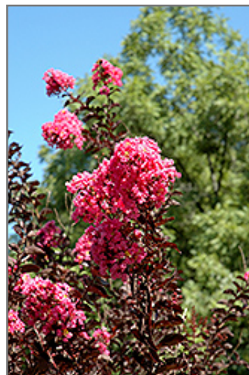
Delta Jazz Crapemyrtle flowers