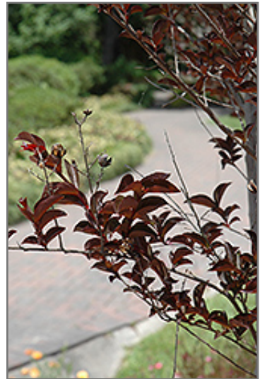
Delta Jazz Crapemyrtle foliage

Delta Jazz Crapemyrtle makes a fine choice for the outdoor landscape, but it is also well-suited for use in outdoor pots and containers. Its large size and upright habit of growth lend it for use as a solitary accent, or in a composition surrounded by smaller plants around the base and those that spill over the edges. It is even sizeable enough that it can be grown alone in a suitable container. Note that when grown in a container, it may not perform exactly as indicated on the tag - this is to be expected. Also note that when growing plants in outdoor containers and baskets, they may require more frequent waterings than they would in the yard or garden.