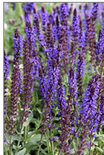
Lyrical Blues Meadow Sage flowers

This is a relatively low maintenance plant, and is best cleaned up in early spring before it resumes active growth for the season. It is a good choice for attracting butterflies and hummingbirds to your yard, but is not particularly attractive to deer who tend to leave it alone in favor of tastier treats. It has no significant negative characteristics.