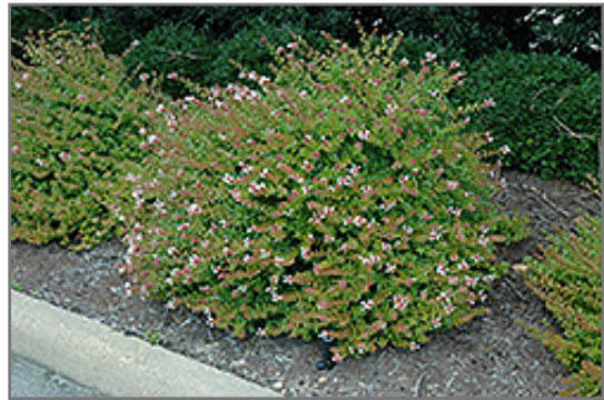
Rose Creek Abelia in bloom

Rose Creek Abelia is recommended for the following landscape applications;