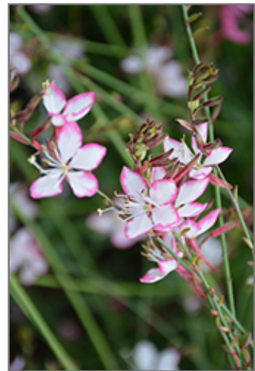
Rosy Jane Gaura flowers

Rosy Jane Gaura is recommended for the following landscape applications;