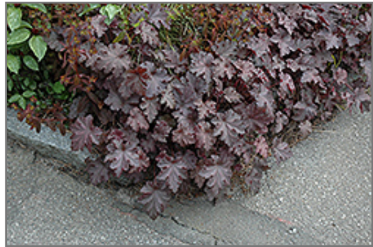
Stormy Seas Coral Bells

Stormy Seas Coral Bells is recommended for the following landscape applications;