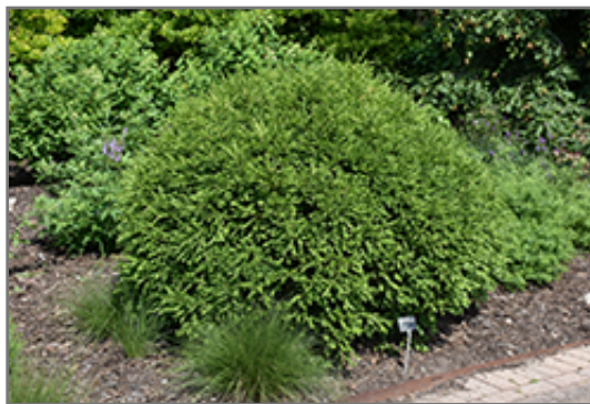
Green Gem Boxwood