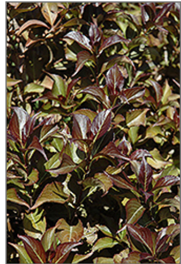
Dark Horse Weigela foliage

Dark Horse Weigela makes a fine choice for the outdoor landscape, but it is also well-suited for use in outdoor pots and containers. Because of its height, it is often used as a 'thriller' in the 'spiller-thriller-filler' container combination; plant it near the center of the pot, surrounded by smaller plants and those that spill over the edges. It is even sizeable enough that it can be grown alone in a suitable container. Note that when grown in a container, it may not perform exactly as indicated on the tag - this is to be expected. Also note that when growing plants in outdoor containers and baskets, they may require more frequent waterings than they would in the yard or garden.